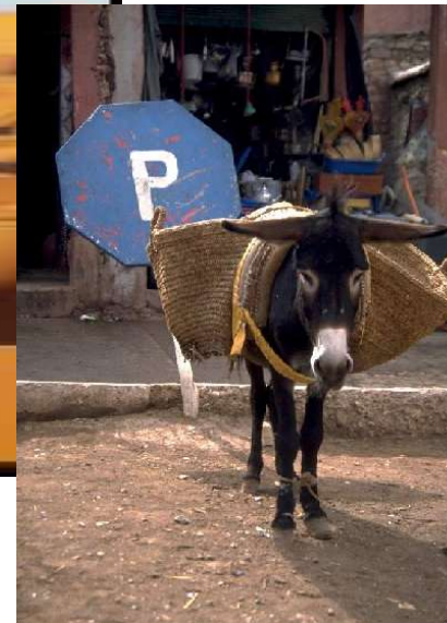
A guided tour through the Moroccan landscape